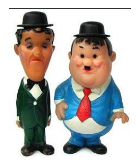
5. They _____ old.